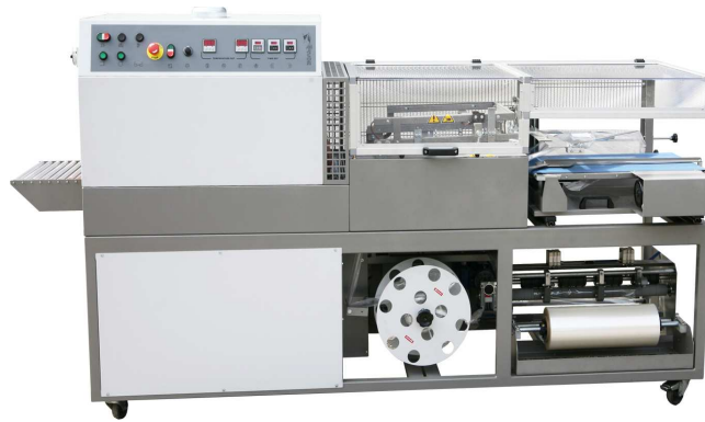
Mod. Dynamic 5038 MB

The automatic L-sealer line with two independent conveyors, is complete of sealing station and shrink tunnel, mounted on one metallic framework, treated and varnished with epossidic powder.