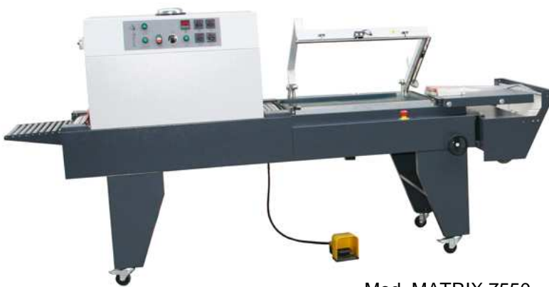
Mod. MATRIX 7550