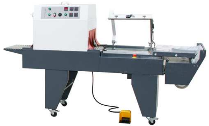
Mod. MATRIX 5040