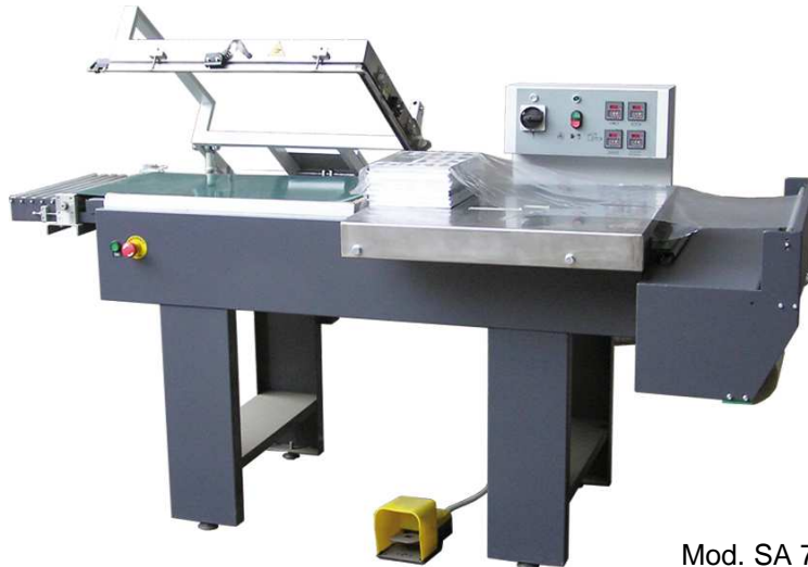
Mod. SA 7050 PNE