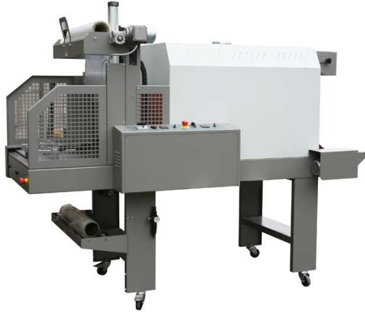
Mod. MA 700 SLIM S