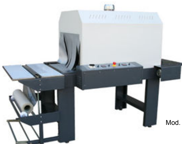
Mod. MA 700 M